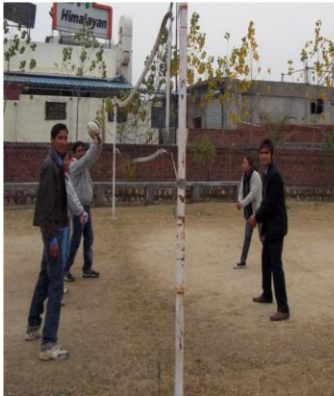
Student,s playing while recess

Brain studies indicate that thinking uses more energy . Although the brain represents Only 2%of the body weight, it recieves 15%oof the cardiac output, 20%of total body oxygen consumption and 25%of of total body glucose utilization. The energy consumption for the brain to simply survive is 0.1calories per minute,while this value can be as high as1.5calories per minute (100W) during crosswords.