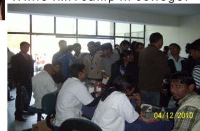
Doctors giving direction during donation Camp.