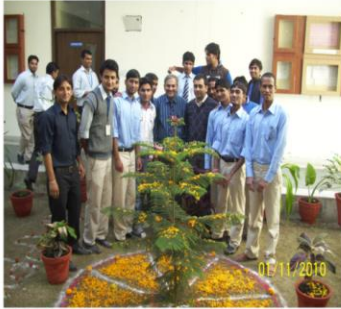
Student's with hounrable director and Chairman sir during activity.