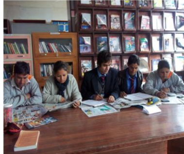
Maintaing the silence and having study.