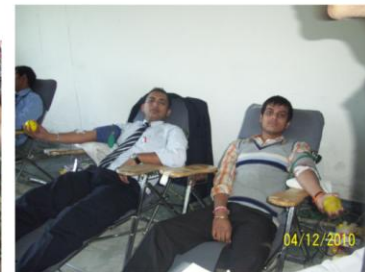
Students donating the blood While IMA camp in college.

Some percentage of child labour comes from brutality/ harassments by parantes or step-parents. They are mainly from urban areas poors .This percentage is too less and easily controllably penalties to such parents and children rights for rural poverty and lack of employment and illitracy has given birth to majority of child problem.