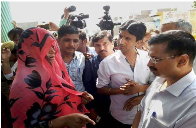
Kejriwal interacting with a victim's family

Arvind Kejriwal reportedly said that justice to 1984 riot victims would have prevented Gujarat, Dadri incident. This remark has yet again ignited the fire between the two communities and politicians. If