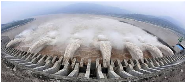
Dam Constructed in Uttarakhand

DEHRADUN: The Government of Uttarakhand has announced the construction of a new ghat