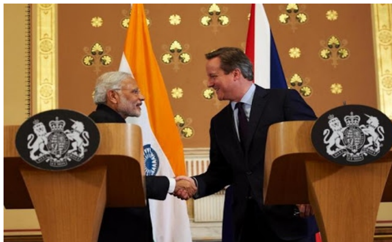
Namo meeting UK President

Queen of the United Kingdom invited the Indian prime minister for lunch at Buckingham palace. The Prime Minister took this