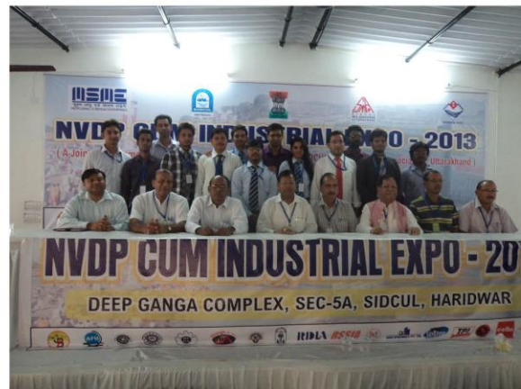
Participants at the industrial Expo 2013 at Haridwar

First part was conducted by Small Industrial Development Bank of India. Second was conducted by Wipro Consulting on Human Capital Practice. Third was a presentation on Disaster Management 4th seminar was:- "Industrial Development- Challenges with Police Administration"-by Police Administration on 19th October 5th seminar was:- "Direct Tax" by Income Tax Department on 19th October 6th seminar was :- "Open Session" in which seminars and presentations were given by BIS, Balmer-Lawrie and Ordnance Factory. 6th seminar was :- "Open Session" in which seminars and presentations were given by BIS, Balmer-Lawrie and Ordnance Factory.