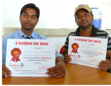
Students who donated blood at DBS Blood CAMP 2013

After the celebration ended we were offered some refreshments. We enjoyed a lot that evening and are thankful to our seniors who made it happen.