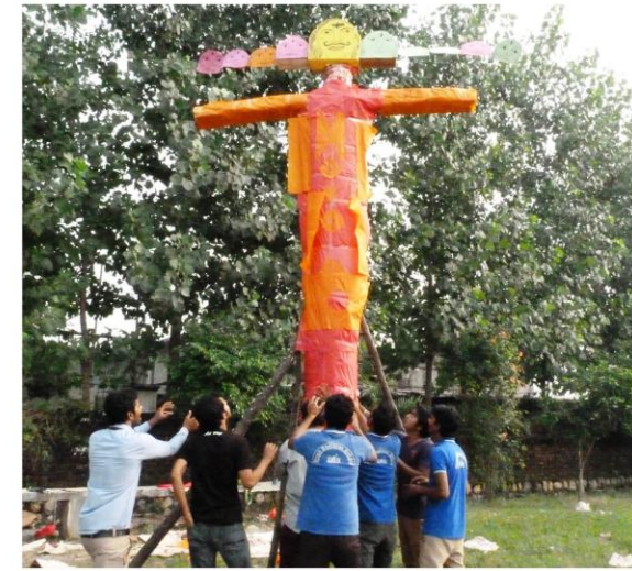
Students Participating at Dusshera celebration